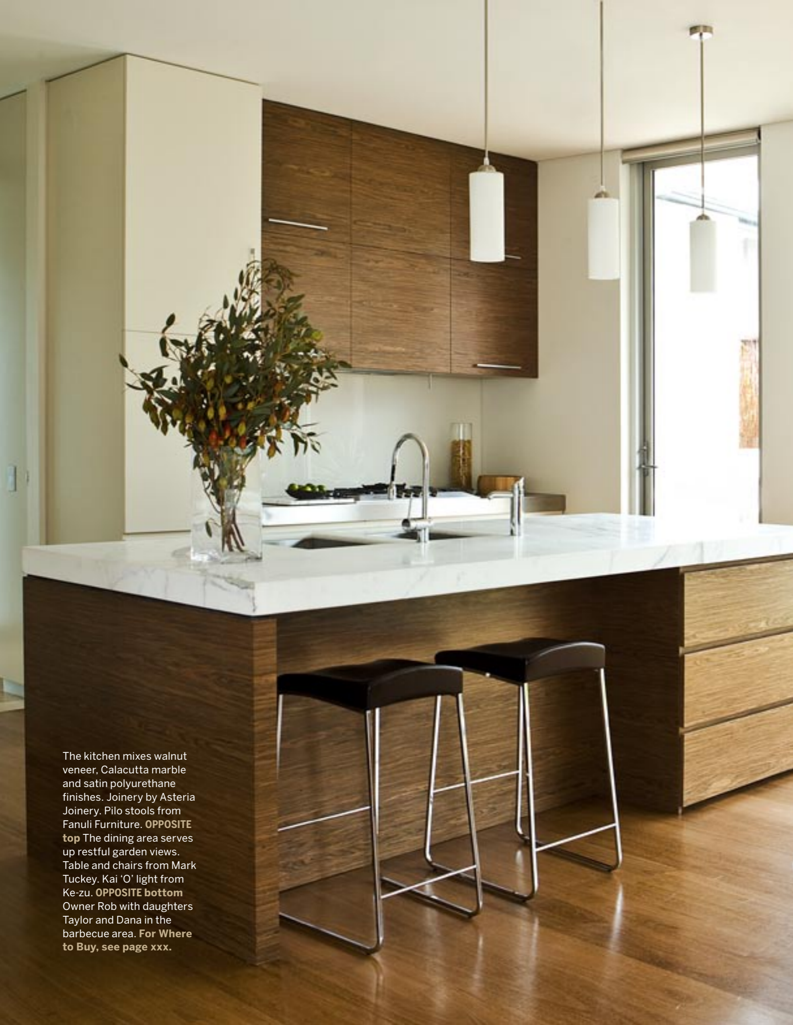
The kitchen mixes walnut veneer, Calacutta marble and satin polyurethane finishes. Joinery by Asteria Joinery. Pilo stools from Fanuli Furniture. OPPOSITE top The dining area serves up restful garden views. Table and chairs from Mark Tuckey. Kai 'O' light from Ke-zu. OPPOSITE bottom Owner Rob with daughters Taylor and Dana in the barbecue area. For Where to Buy, see page xxx.